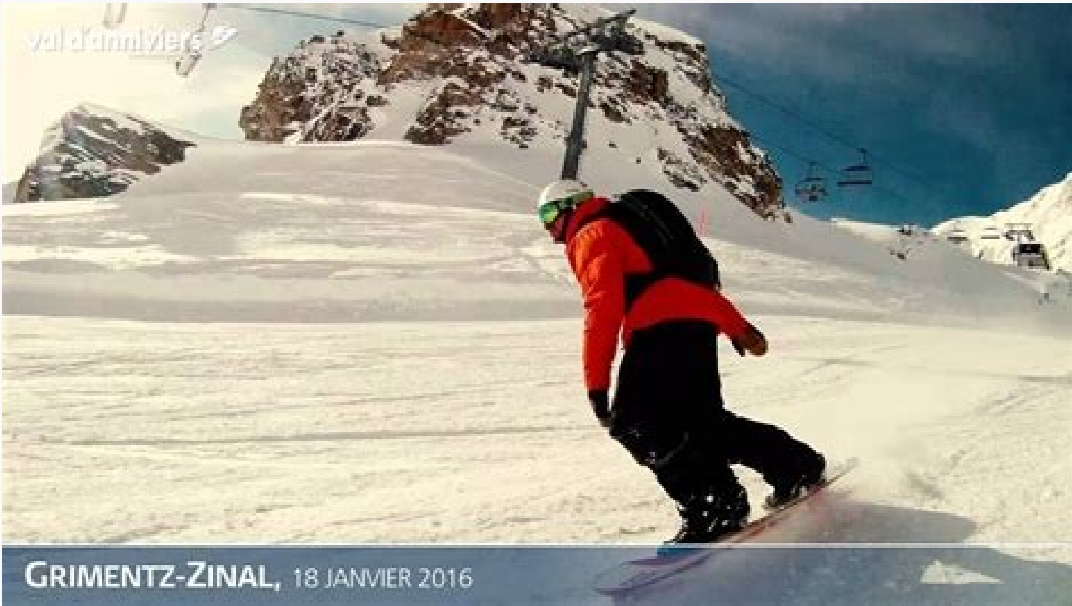
Open snow snow report. Zinal snow conditions.